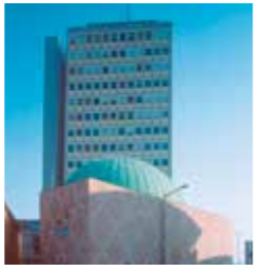
Hochhaus am Plärrer (Plärrer skyscraper) and Planetarium

It was here, in 1835, that the "Adler", Germany's first train, started its journey from Nürnberg to Fürth. On the western edge of Plärrer you can see the "Plärrer-Hochhaus" (Plärrer skyscraper) – built in 1953. Now a listed building, the 56 metre high block was the highest building in Bavaria when it was first built.