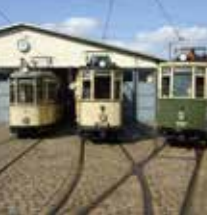
Historisches Straßenbahndepot St. Peter