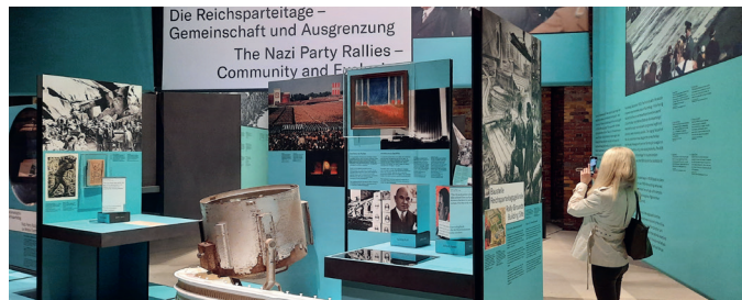
View of the interim exhibition